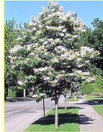
Japanese Lilac Tree