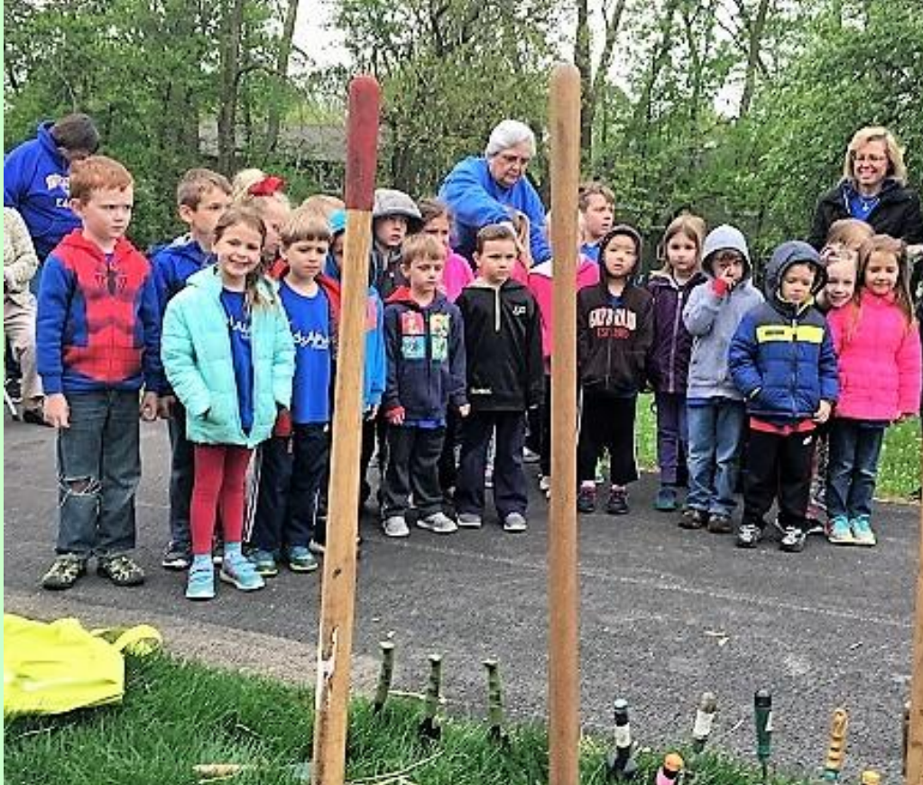
Arbor Day 2017